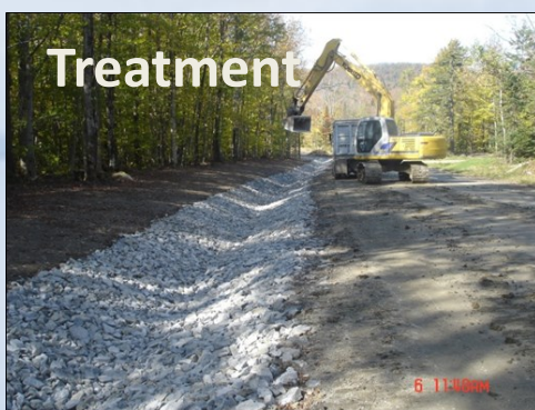
Ditch stabilization saves road repairs and reduces erosion