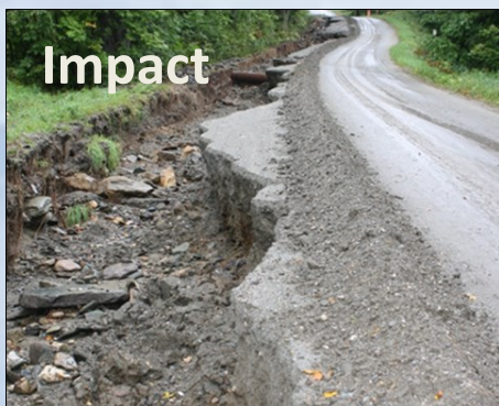
Eroding roadside ditch

This factsheet summarizes actions described in the state plan to reduce road-related sources of phosphorus. See Factsheet #2 for information on reducing phosphorus pollution from stormwater runoff from all other impervious surfaces, such as parking lots. See other factsheets that describe actions to reduce phosphorus from other sources.