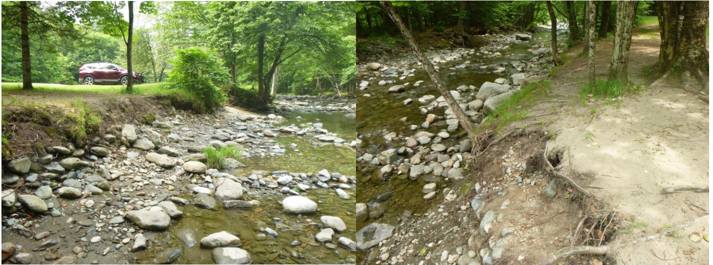
Eroding banks and compacted soils along Martins Brook at Shady Rill Recreation

Over 2018 and 2019 the Winooski NRC and Watershed Consulting Associates engaged with state and local stakeholders to develop 100% design plans to remove encroachment features and restore Martins Brook streambank. Final design elements for the restoration of the riparian buffer for Martins Brook include the following tasks: