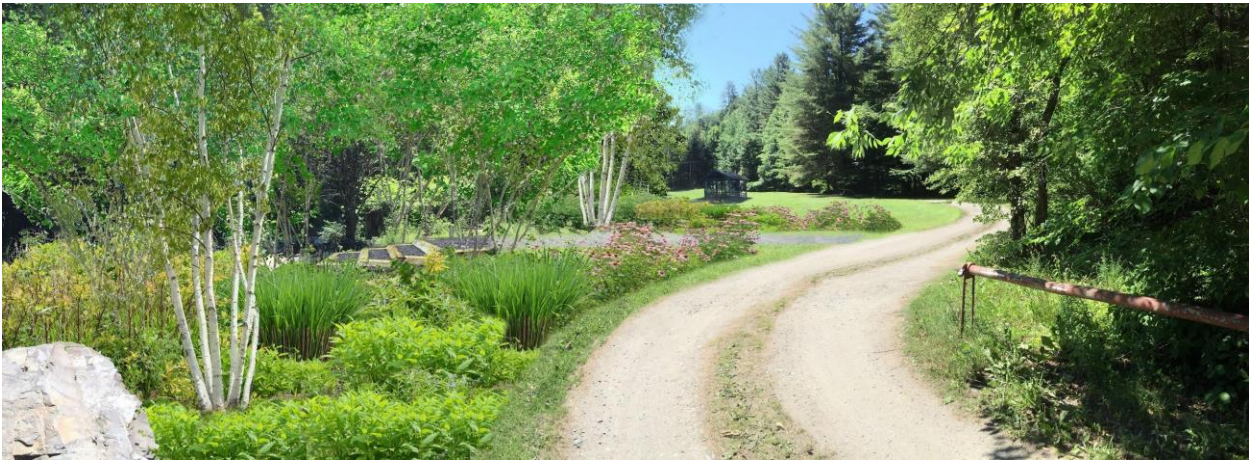
Existing condition of park access road and artist rendition of improved buffer planting