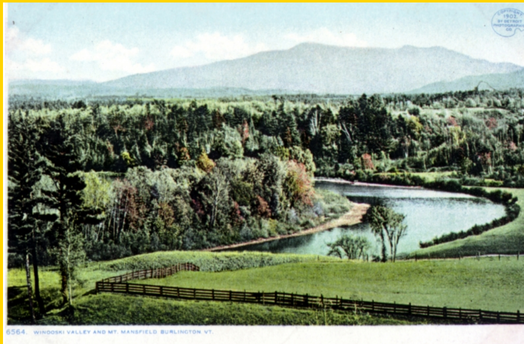
The Winooski River Valley, Burlington, Vermont – LS00691

The Winooski River watershed has been dammed for over 220 years. Today, billions of gallons of water are stored in dam reservoirs, preventing damaging floods and producing hydroelectricity. Agents of tremendous change, dams have forever altered Vermont's landscape. Continue on to learn about the history behind the damming of the Winooski River watershed.