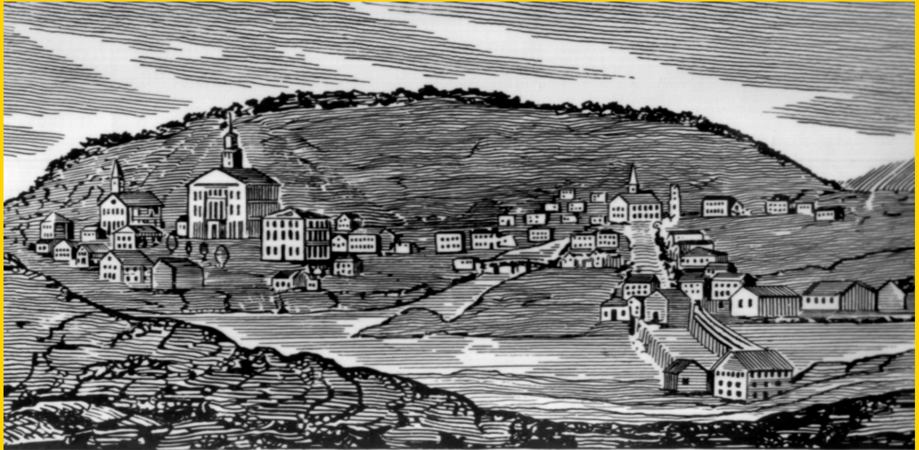
FIRST KNOWN PICTURE OF MONTPELIER, VERMONT. DATED 1821.

Vermont's capital, Montpelier, was built upon the Winooski River. By 1821 the growing town had two dams visible in the picture below. One appears to have been built across the Winooski River, while the other was built across a smaller tributary. A cotton mill in Montpelier had been running off of hydropower since 1810. LS06266.