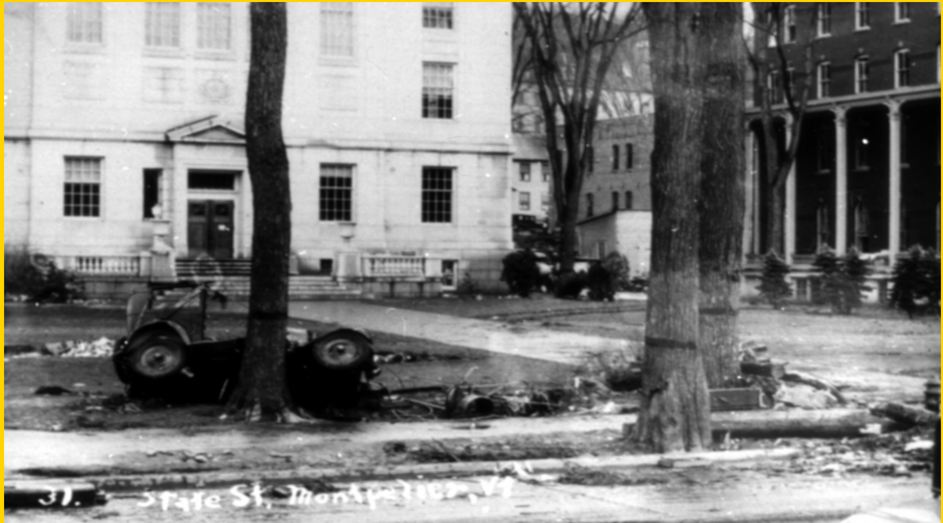
31. State St. Montpelier, VT

Montpelier was hit hard by the Flood of 1927. Three tributaries joining the Winooski River in Montpelier caused flood waters to exceed ten feet within the city, as shown on the trees in the photo below! It became clear the city would have to protect itself from future floods of such high magnitude. LS06039.