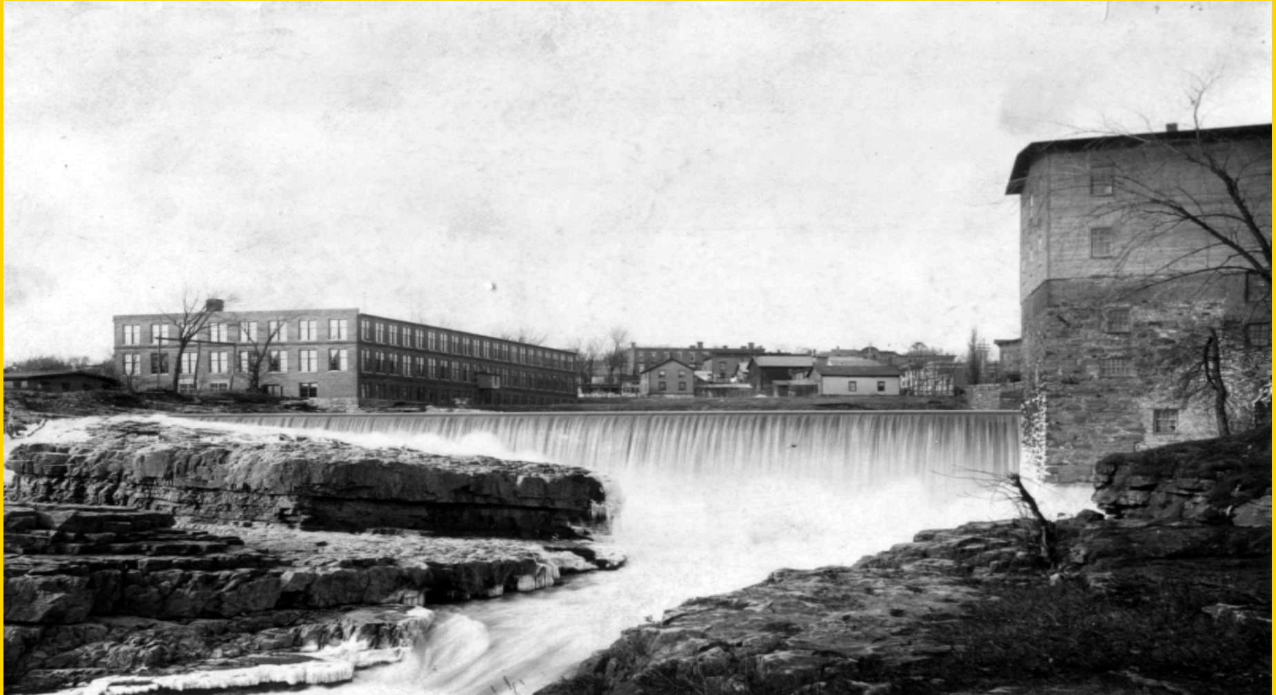
The Lower Falls Dam on the Winooski River, Winooski, Vermont – LS02284

The importance of dams cannot be underestimated. Since the late 1700's, mills run on water-powered machinery produced lumber, iron, food and clothing. Staples upon which young towns were built and relied upon for survival throughout the Winooski River watershed.