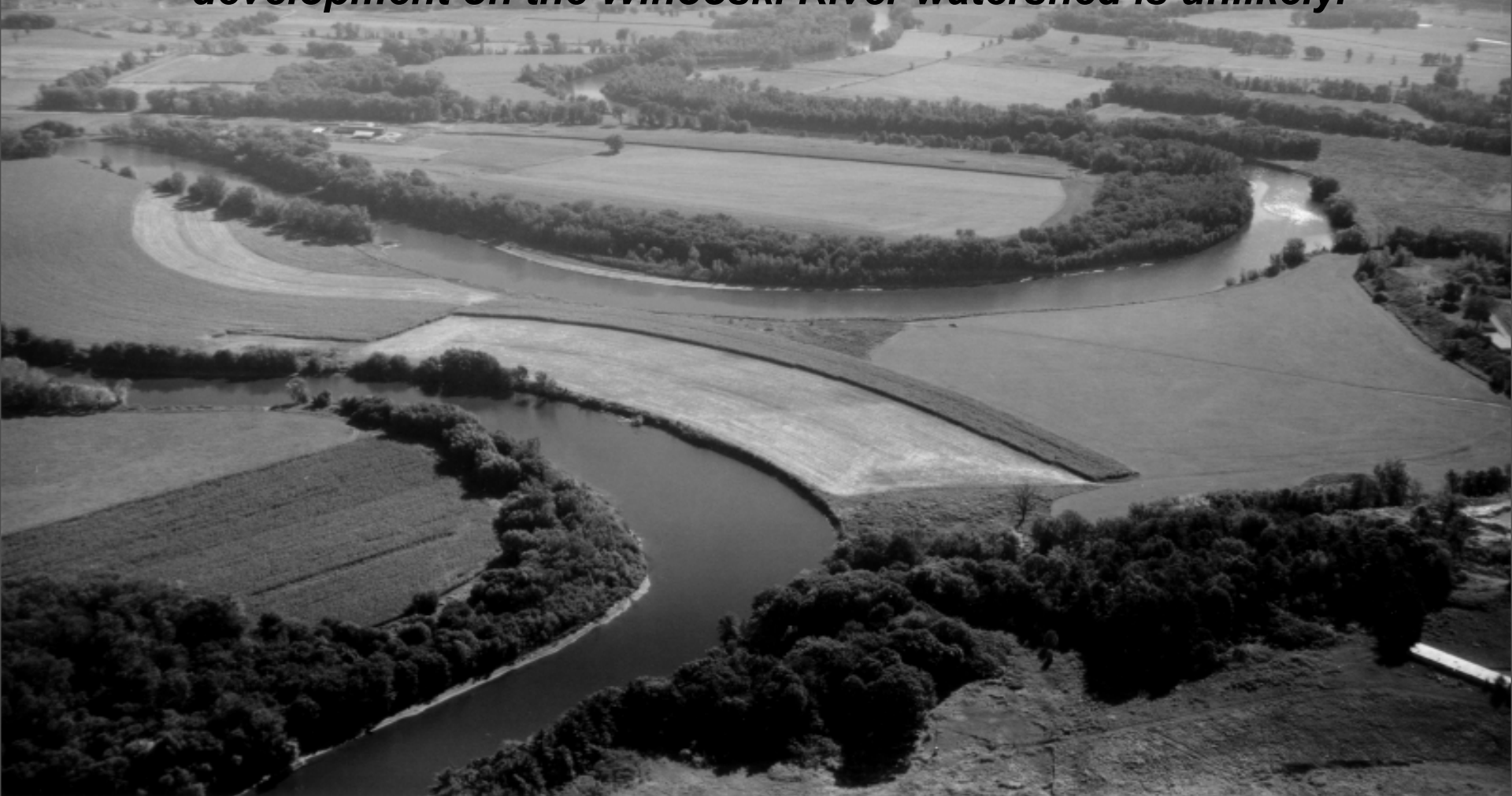
Aerial Photo of Winooski River looking towards Burlington, Vermont. LS06743

Although many have been abandoned, seventeen hydroelectric dams still exist on the Winooski River watershed, producing 43 Megawatts of renewable energy while providing flood control. The Bolton Falls Dam is the Winooski River's biggest producer at 8.8 Megawatts. Because of their tremendous impact on the land and its waterways, future dam development on the Winooski River watershed is unlikely.