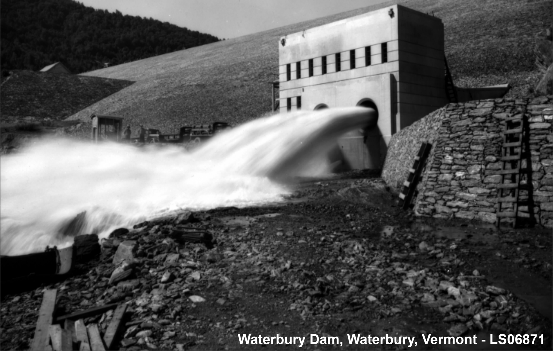
Waterbury Dam, Waterbury, Vermont - LS06871