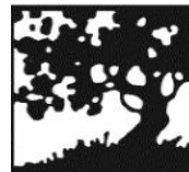
Vermont Land Trust (VLT)