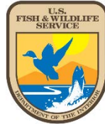
U.S. Fish and Wildlife Service (USFWS or FWS)