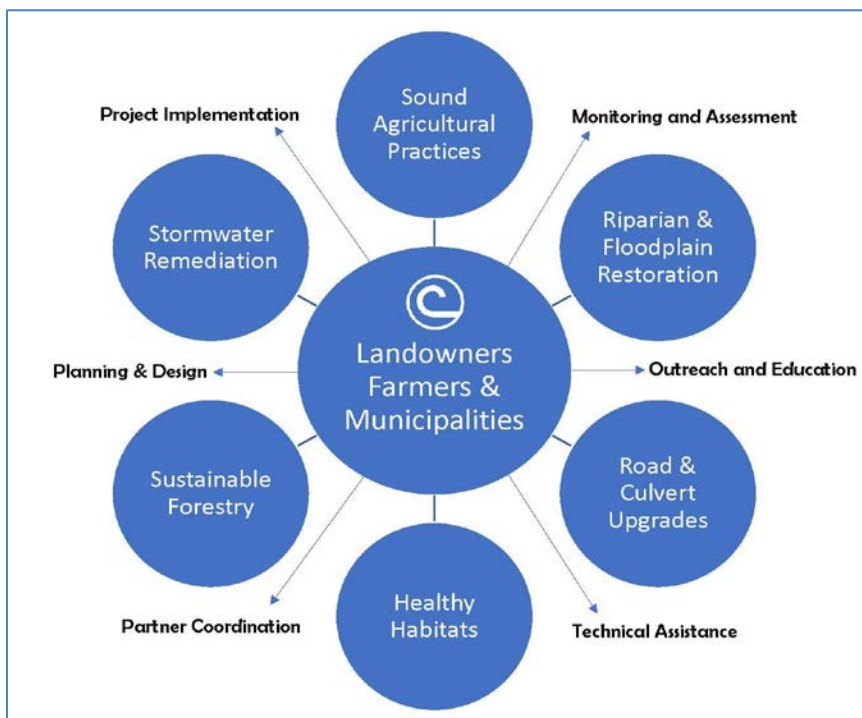
Vermont Conservation District Programs, Strategies and Outcomes for Water Quality and Natural Resources Conservation

Based on the natural resources concerns within the Conservation District and the services provided by other organizational partners, each Conservation District may place a stronger emphasis on one or more program area(s). Projects and programs may also change from year to year depending on funding and priorities. The outcomes and benefits of Conservation District work serve several sectors, including agriculture, municipal stormwater, riparian and floodplain restoration, among others. Examples of Conservation District activities and programs include agricultural assistance, tactical basin planning, municipal stormwater remediation, natural resource conservation and restoration.